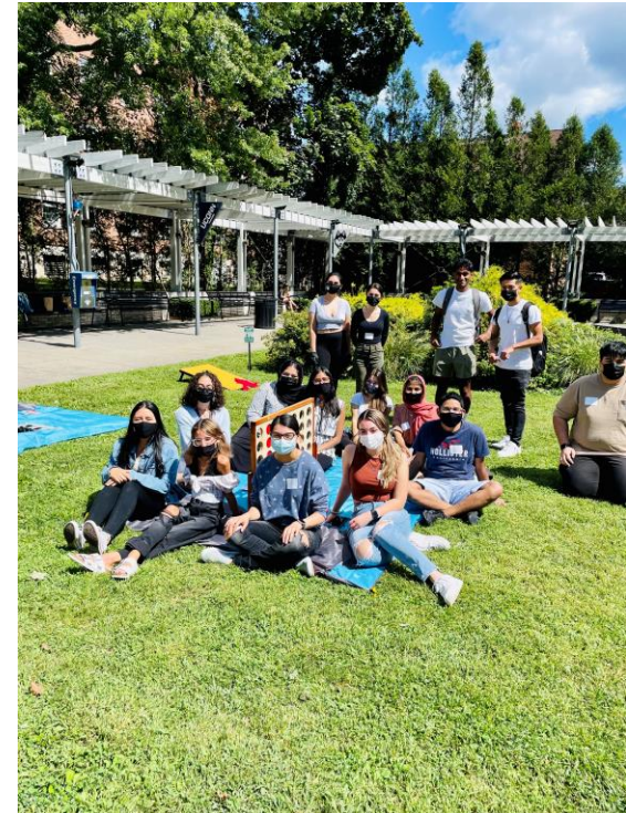
Honors Meet & Greet at Stamford 2021