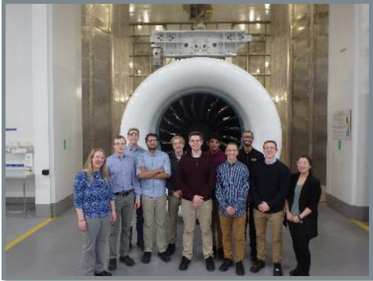
Field trip to Pratt & Whitney.