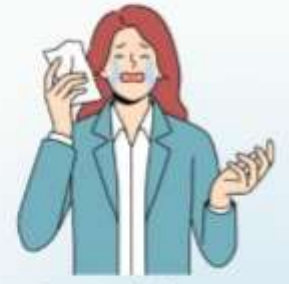
One bad thing = complete failure