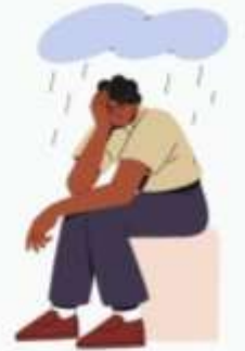
Believing criticism over compliments